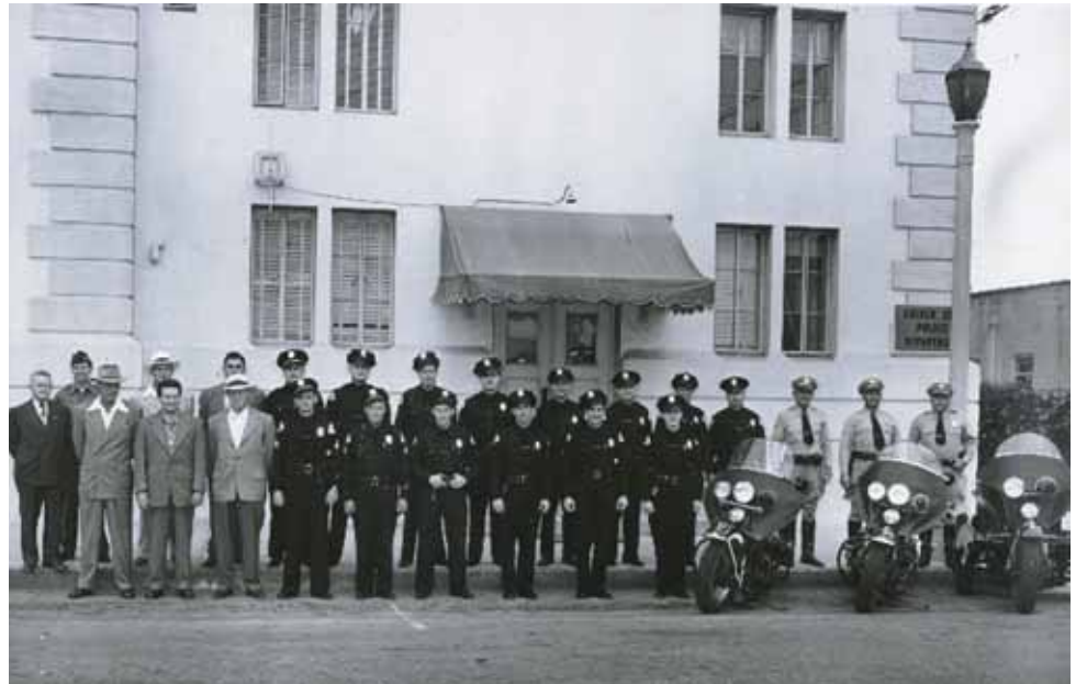
The Culver City Police Department when it was located in the 1928 Culver City Hall at Culver Boulevard and Duquesne Avenue. The entry was on the Duquesne side. (Photo circa 1950)

For more information, please call the Society at (310) 253-6941 or inquire by e-mail at info@CulverCityHistoricalSociety.org . Also, visit the CCHS website at: www.culvercityhistoricalsociety.org for updates.