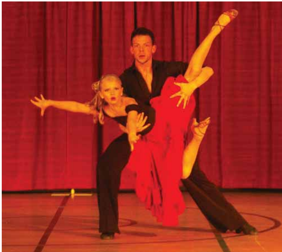
USA Dance L.A. County will present "2011 Ballroom Showcase Spectacular" at the Culver City Veterans Auditorium Sunday from 3:45 pm to 6:15.