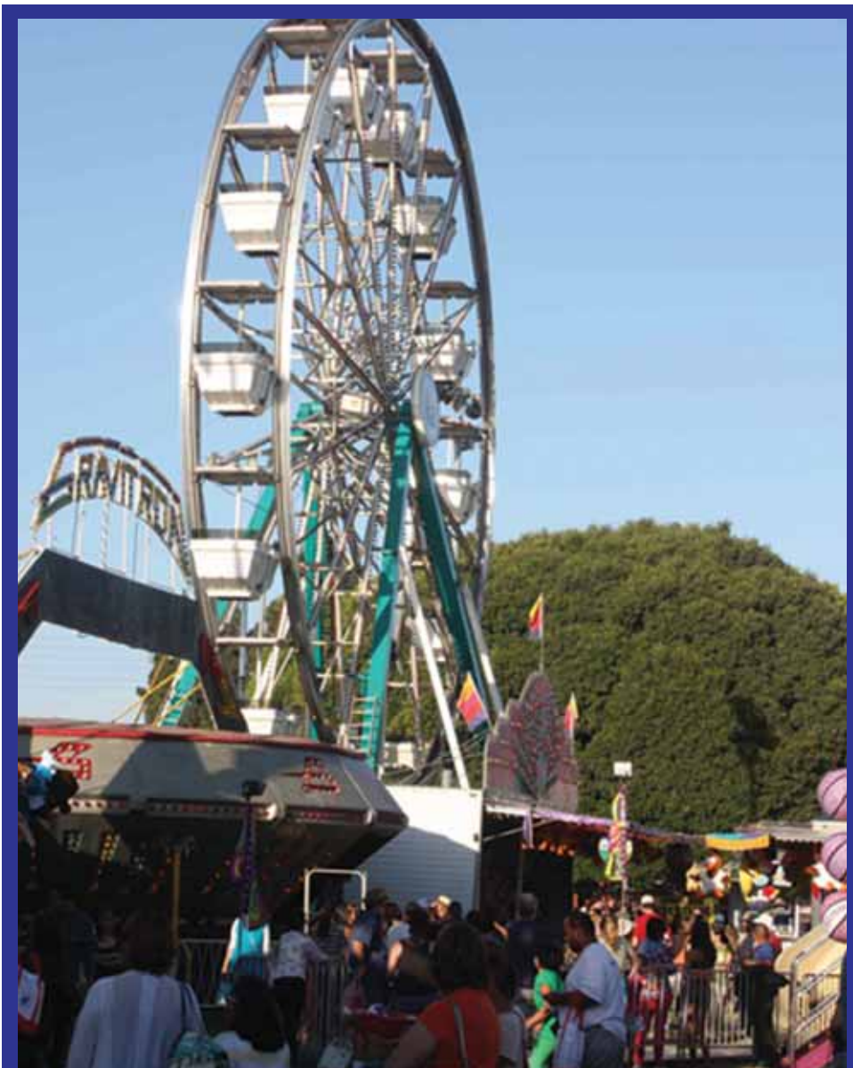
FIESTA 2011-Food, rides, music and a ferris wheel were featured as thousands attended the annual Culver City event at Veteran's Park last weekend. The three-day event dates back to 1951. The Culver City Fire Department was on hand as was the Police department with a demonstration by the K-9 dogs.