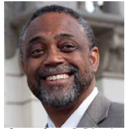
Senator Curren D. Price, Jr.

Curren Price represents a district that includes Culver City